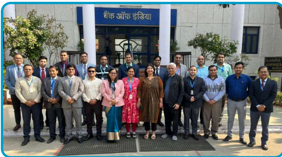
Program conducted by ISTD for Bank of India at Noida, UP