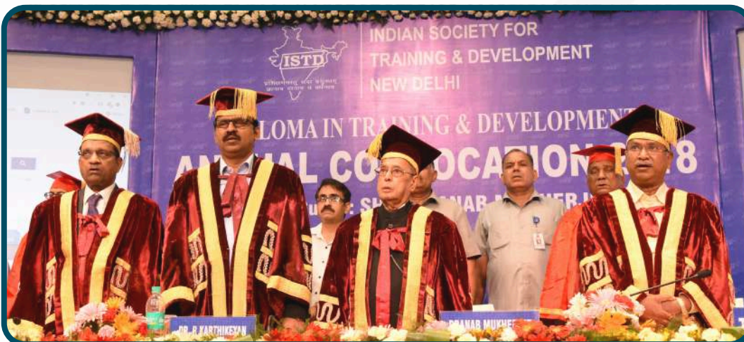
Shri Pranab Mukherjee, President of India (2012-17) at the Convocation ceremony